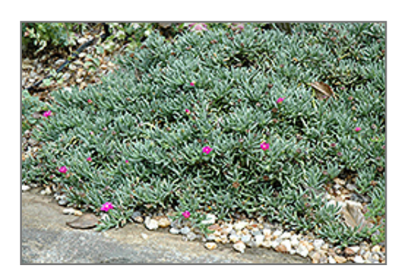
Shrubby Ice Plant in bloom

Garden Treasures, LLC 29350 Matthewstown Road Easton, Maryland 21601 www.gardentreasuresmd.com 410.822.1604