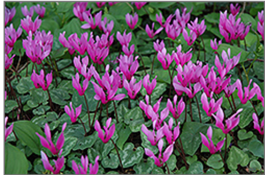
Purple Cyclamen in bloom