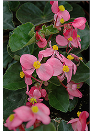
BabyWing Pink Begonia flowers

BabyWing Pink Begonia is recommended for the following landscape applications;