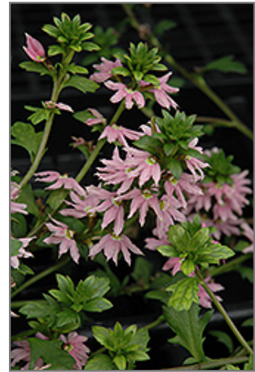
Bombay Pink Fan Flower flowers