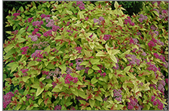
Magic Carpet Spirea flowers