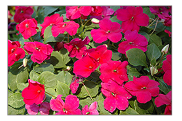
Super Elfin Velvet Impatiens flowers

Garden Treasures, LLC 29350 Matthewstown Road Easton, Maryland 21601 www.gardentreasuresmd.com 410.822.1604