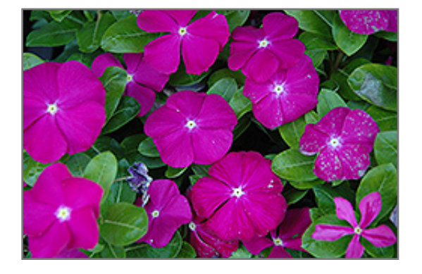
Sunstorm Deep Orchid Vinca flowers

Garden Treasures, LLC 29350 Matthewstown Road Easton, Maryland 21601 www.gardentreasuresmd.com 410.822.1604