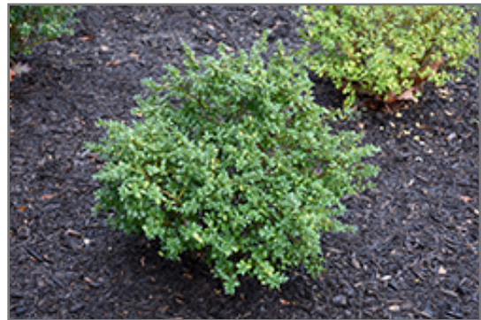
Green Lustre Japanese Holly