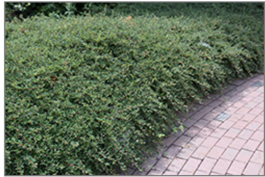
Coral Beauty Cotoneaster