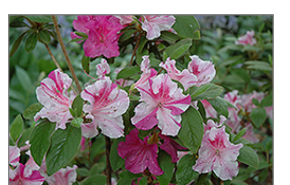
Encore Autumn Twist Azalea flowers

When grown indoors, Encore Autumn Twist Azalea can be expected to grow to be about 3 feet tall at maturity, with a spread of 3 feet. It grows at a slow rate, and under ideal conditions can be expected to live for approximately 40 years. This houseplant will do well in a location that gets either direct or indirect sunlight, although it will usually require a more brightly-lit environment than what artificial indoor lighting alone can provide. It requires an evenly moist well-drained soil for optimal growth, but will suffer if left to grow in standing water. The surface of the soil shouldn't be allowed to dry out completely, and so you should expect to water this plant once and possibly even twice each week. Be aware that your particular watering schedule may vary depending on its location in the room, the pot size, plant size and other conditions; if in doubt, ask one of our experts in the store for advice. It is very fussy about its soil conditions and must be grown in rich, acidic soil to ensure success. Contact the store for specific recommendations on pre-mixed potting soil for this plant.