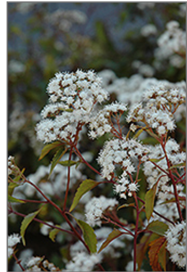
Chocolate Boneset flowers

Chocolate Boneset is recommended for the following landscape applications;