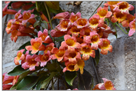
Tangerine Beauty Cross Vine flowers

Tangerine Beauty Cross Vine will grow to be about 30 feet tall at maturity, with a spread of 3 feet. As a climbing vine, it tends to be leggy near the base and should be underplanted with low-growing facer plants. It should be planted near a fence, trellis or other landscape structure where it can be trained to grow upwards on it, or allowed to trail off a retaining wall or slope. It grows at a fast rate, and under ideal conditions can be expected to live for approximately 20 years.