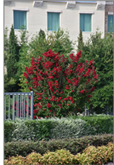
Double Dynamite Crapemyrtle in bloom

This shrub does best in full sun to partial shade. It prefers to grow in average to moist conditions, and shouldn't be allowed to dry out. It is very fussy about its soil conditions and must have rich, acidic soils to ensure success, and is subject to chlorosis (yellowing) of the foliage in alkaline soils. It is highly tolerant of urban pollution and will even thrive in inner city environments. This is a selected variety of a species not originally from North America.