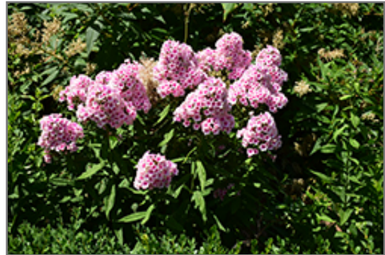
Bright Eyes Garden Phlox in bloom