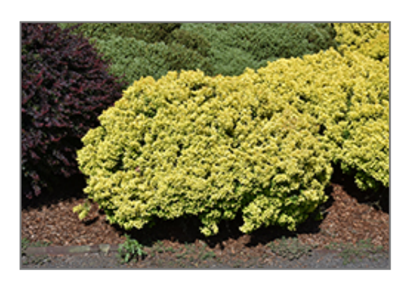
Golden Nugget Japanese Barberry

Golden Nugget Japanese Barberry is recommended for the following landscape applications;