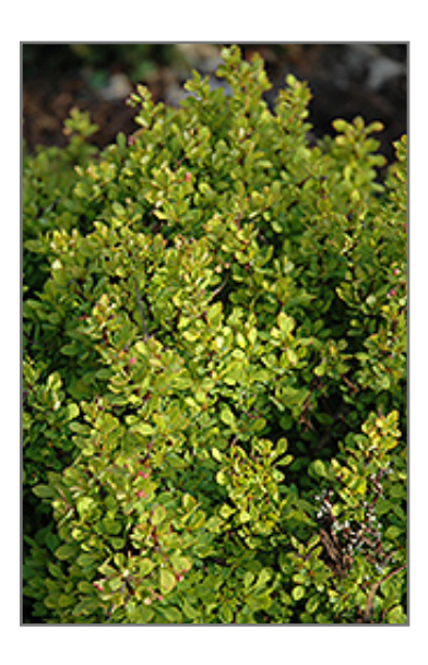
Golden Nugget Japanese Barberry foliage