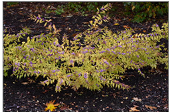
Early Amethyst Beautyberry fruit