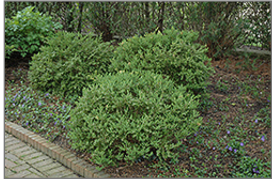
Wintergreen Boxwood