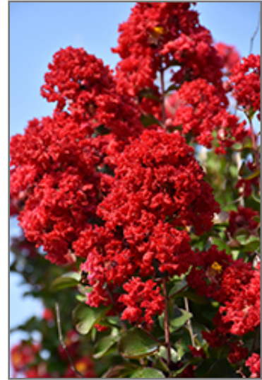
Dynamite Crapemyrtle flowers