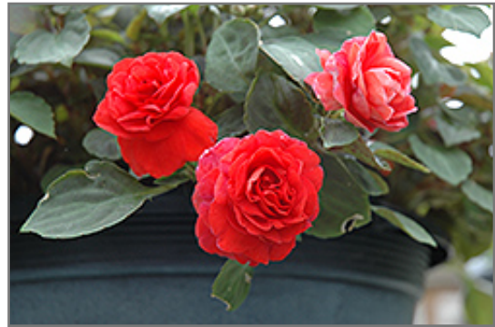
Fiesta Ole Deep Orange Double Impatiens flowers