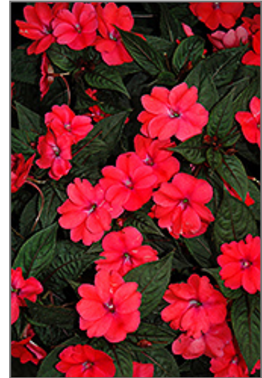
SunPatiens Compact Deep Rose New Guinea Impatiens flowers

This plant will require occasional maintenance and upkeep, and should not require much pruning, except when necessary, such as to remove dieback. It is a good choice for attracting bees and butterflies to your yard. It has no significant negative characteristics.