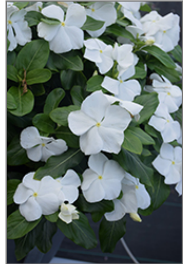
Titan Pure White Vinca flowers

Titan Pure White Vinca is recommended for the following landscape applications;