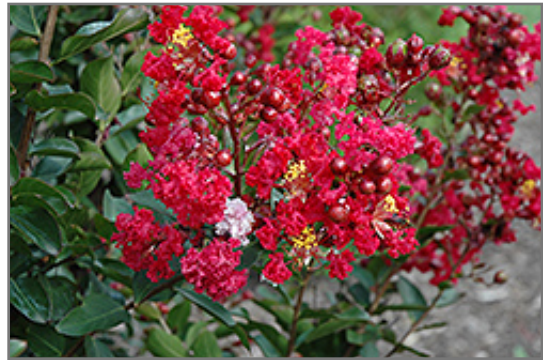
Red Rooster Crapemyrtle flowers

Red Rooster Crapemyrtle is recommended for the following landscape applications;