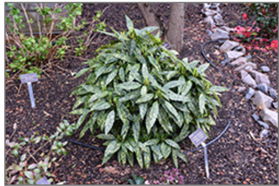
Hosoba Hoshifu Aucuba