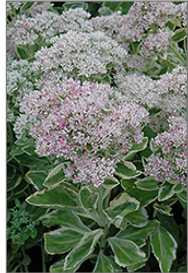
Frosty Morn Stonecrop flowers