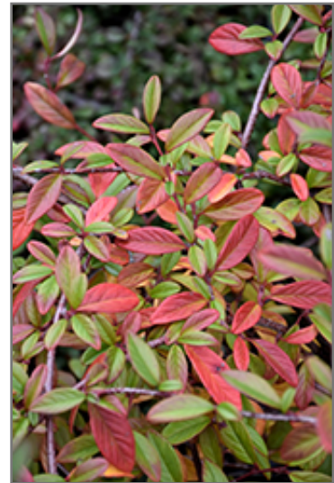
Scarlet Leader Willowleaf Cotoneaster in fall

This shrub does best in full sun to partial shade. It is very adaptable to both dry and moist growing conditions, but will not tolerate any standing water. It is not particular as to soil type or pH, and is able to handle environmental salt. It is highly tolerant of urban pollution and will even thrive in inner city environments. This is a selected variety of a species not originally from North America.