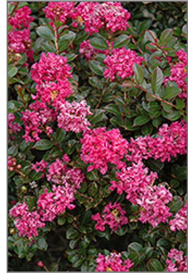
Pocomoke Crapemyrtle flowers

Pocomoke Crapemyrtle is recommended for the following landscape applications;