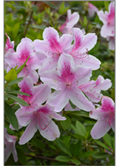
George Lindley Taber Azalea flowers